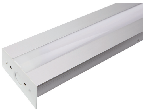
Frosted Lens Option