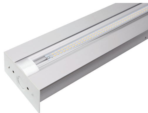
Clear Lens Option