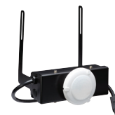
Optional Motion Sensor (EPM-HA-MS) and Lens