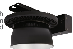
Shown With Aluminum Shroud