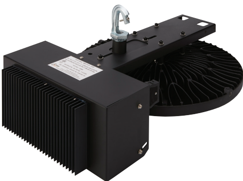
Heat Sink and Hanging Hook (EPM-HA-HH)